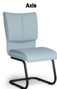
2600-GT Mid-Back GT