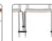
GC7 GANGING CLIP (4-LEG ONLY)