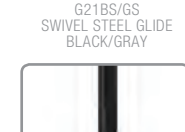
G21BS/GS SWIVEL STEEL GLIDE BLACK/GRAY