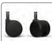
C12S HARD FLOOR AND CARPET CASTERS (4-LEG CASTERS ONLY)