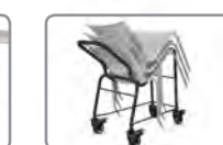
DL5 STACKING DOLLY