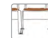
GC5 GANGING CLIP (SLED BASE ONLY)