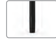
G21B/G TAPERED PLASTIC GLIDE BLACK/GRAY