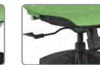
S3 SWIVEL TILT