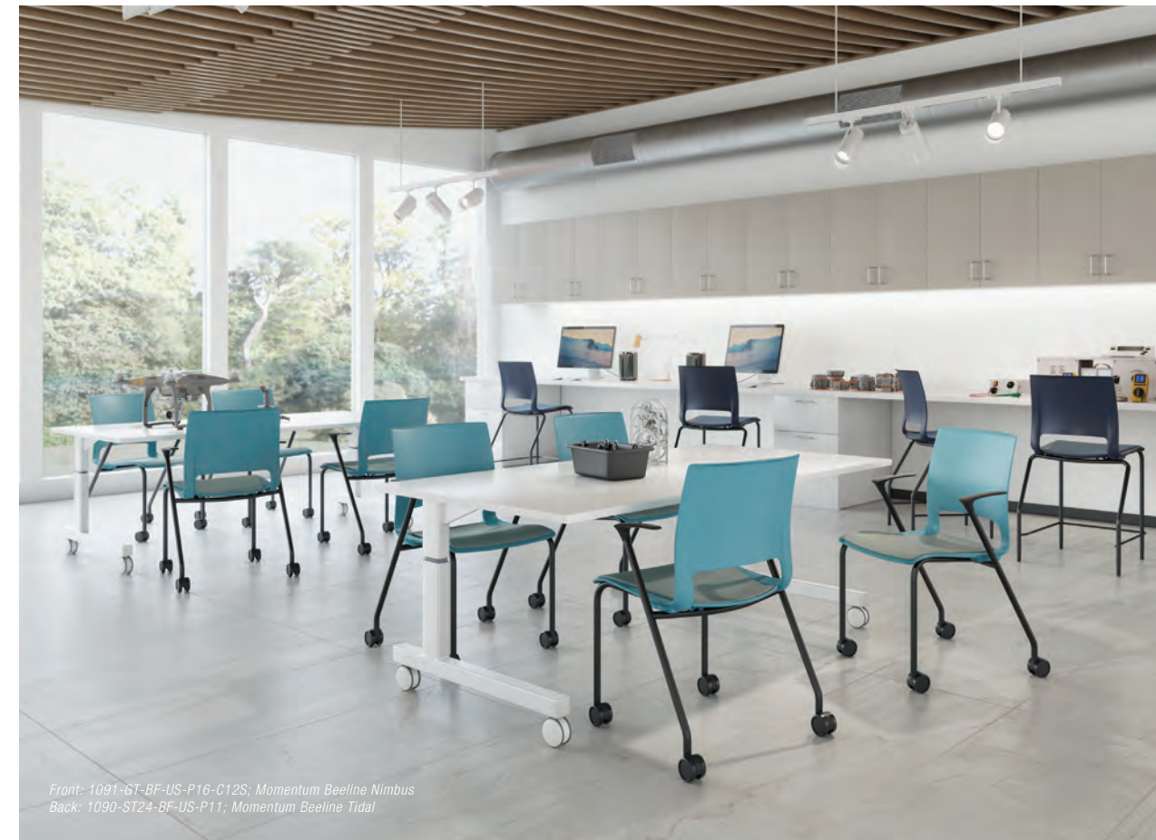
Front: 1091-GT-BF-US-P16-C12S; Momentum Beeline Nimbus Back: 1090-ST24-BF-US-P11; Momentum Beeline Tidal