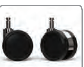
C7 CHROME-ACCENTED CASTERS (TASK ONLY)