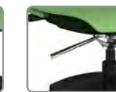
R2 ROCKING TILT