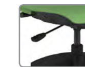
B1 BASIC TASK