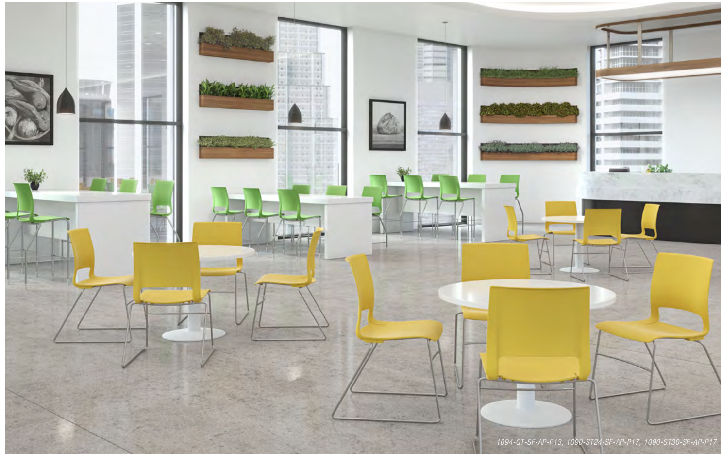
1094-G1-SF-AP-P13, 1090-ST24-SF-AP-P17, 1090-ST30-SF-AP-P17