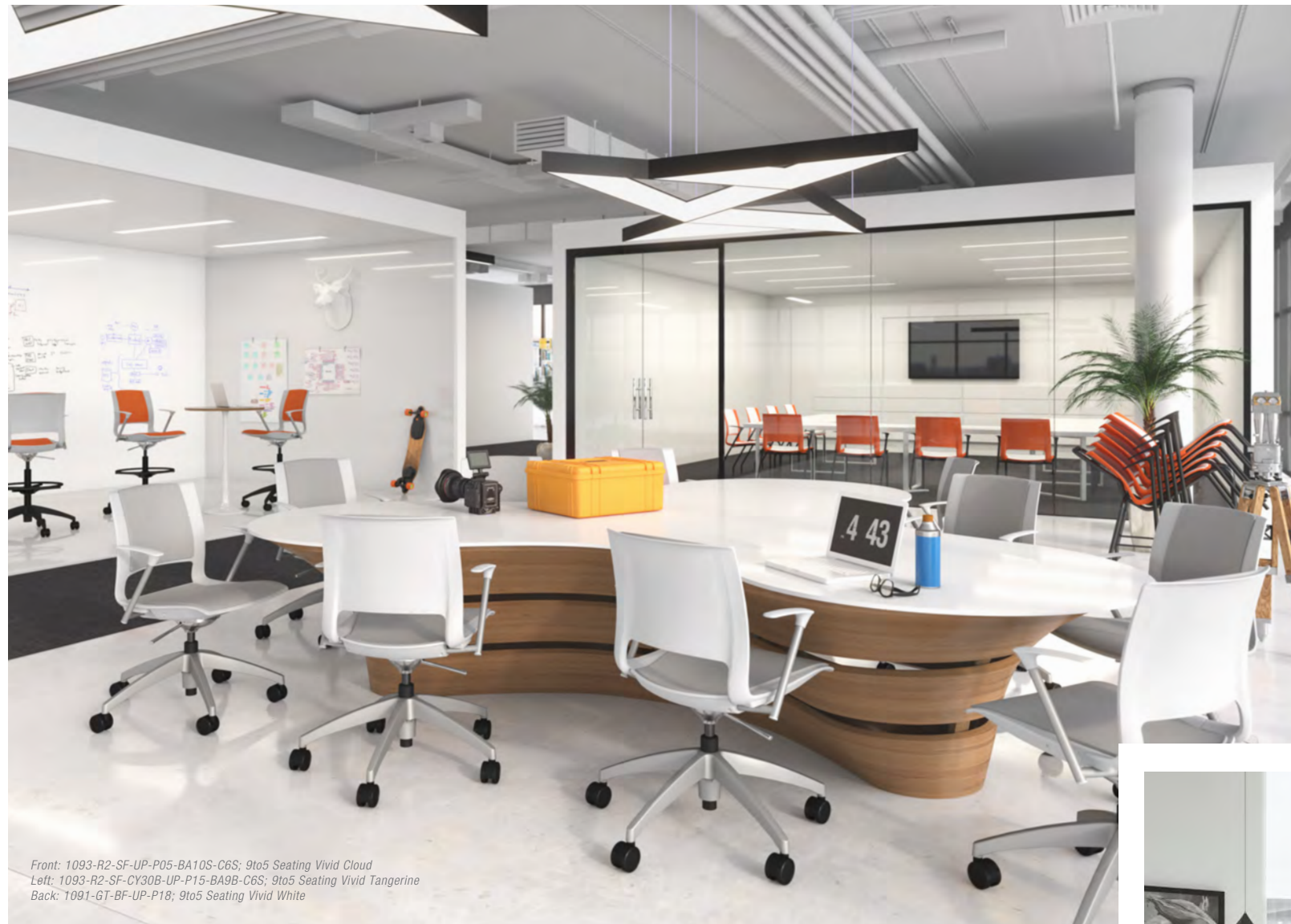
Front: 1093-R2-SF-UP-P05-BA10S-C6S; 9to5 Seating Vivid Cloud Left: 1093-R2-SF-CY30B-UP-P15-BA9B-C6S; 9to5 Seating Vivid Tangerine Back: 1091-GT-BF-UP-P18; 9to5 Seating Vivid White