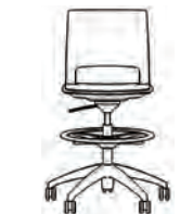
CY30B 8" STOOL (SEAT HEIGHT: 18.2" - 26.2") USE FOR WORK SURFACES UP TO 36"