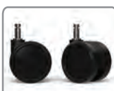
C6S LARGE DIAMETER HARD FLOOR AND CARPET CASTERS (TASK ONLY)