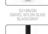
G21B/N/G SWIVEL NYLON GLIDE BLACK/GRAY