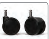
C6 LARGE DIAMETER CARPET CASTERS (TASK ONLY)